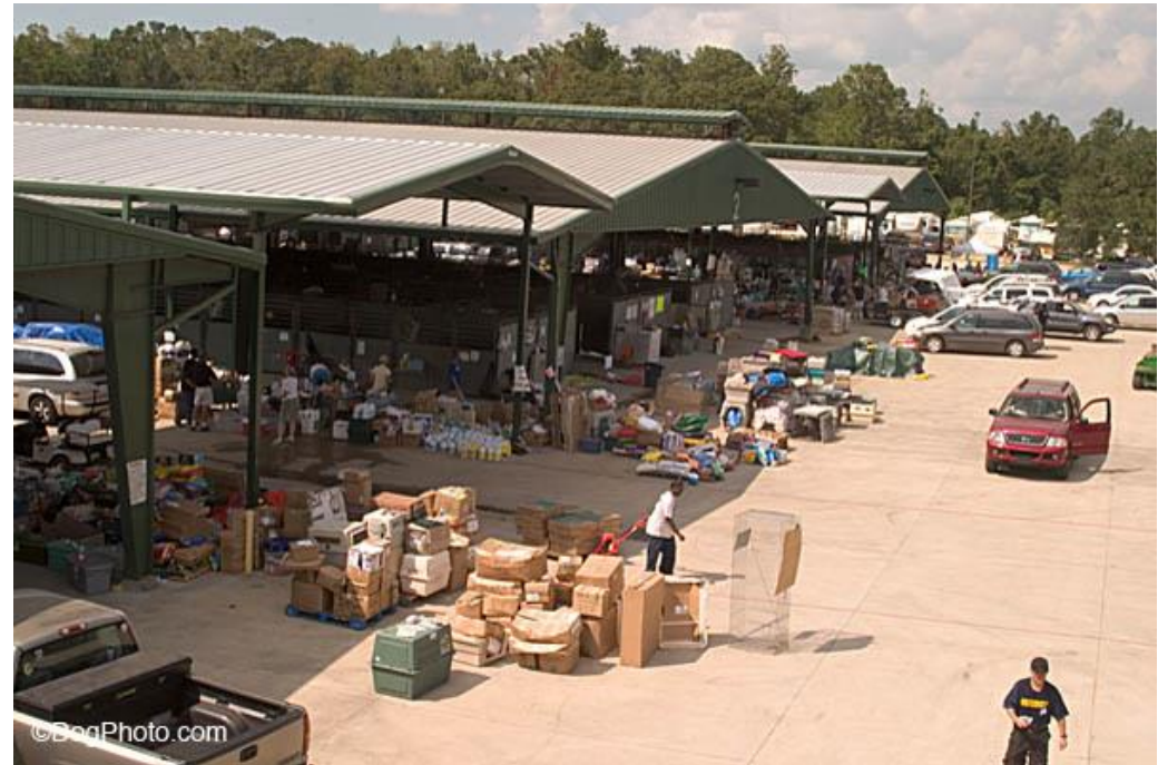
Lamar-Dixon, Sep 05