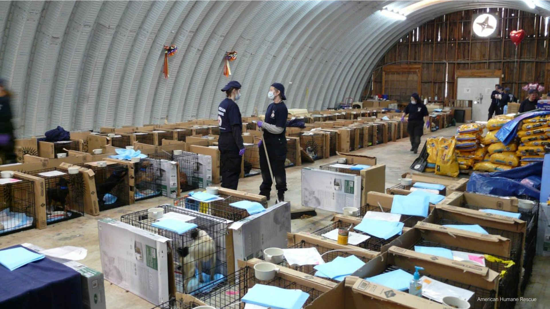
American Humane Rescue